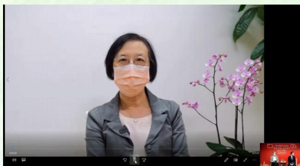
Opening speech by Professor Sophia CHAN, JP Secretary for Food and Health Government of the Hong Kong SAR