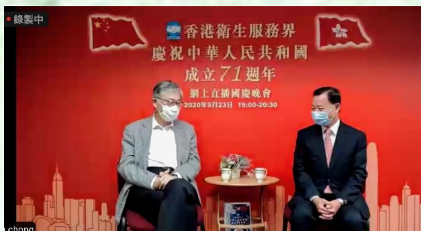
Keynote speech by Mr Shih Wing Ching 施永青

HKAN and 14 Colleges, including HKCERN, co-hosted the on line National Day Celebration Ceremony on 23 Sept 2020